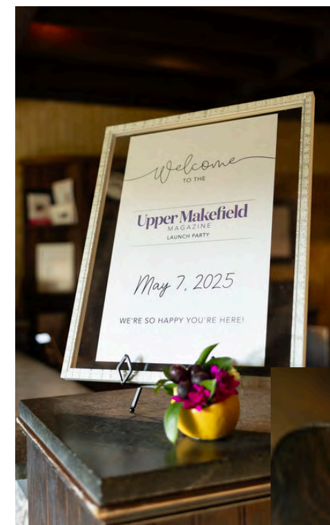
Scenes from an Upper Makefield hosted event